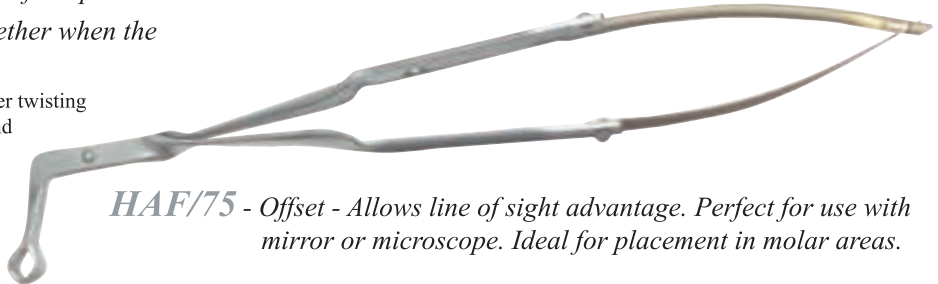
HAF/75 - Offset - Allows line of sight advantage. Perfect for use with mirror or microscope. Ideal for placement in molar areas.

* The forceps will allow conventional finger twisting of the driver while holding, stabilizing and screwing in the healing abutment.