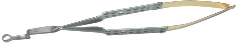
HAF/90 - The perfect universal forceps.

Gently holds and stabilizes healing abutments during the approach, positioning and placement into the implant. The driver easily screws the healing abutment into the implant while being secured by the forceps.