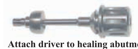
Attach driver to healing abutment